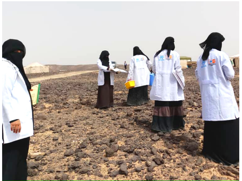
Midwives of a UNFPA mobile reproductive health team at Al Suwaida Camp in Marib, assisting displaced women and girls