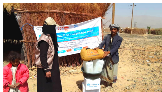
Displaced families with their RRM kits in Marib and Al Jawf Governorates