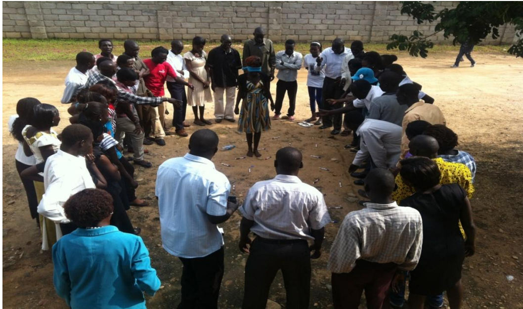
Youth participate in the Peer Education Training Workshop in Juba.