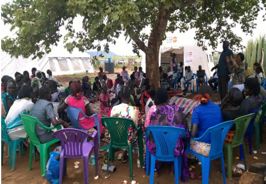
UNFPA Midwife talks to women about the services available to them in the PoC.