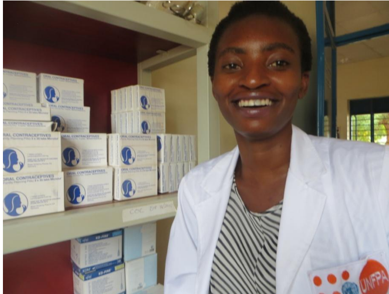
UNFPA midwife raising awareness around family planning in Wau.