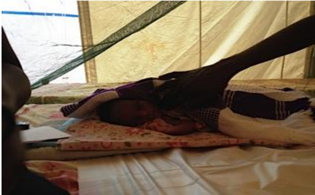
A newborn baby at the UNFPA-supported RH clinic in Tomping PoC, Juba.