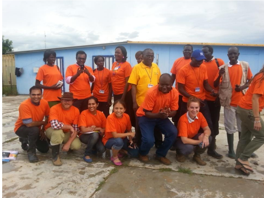
GBV and Reproductive Health specialists completed CMR training in Malakal .