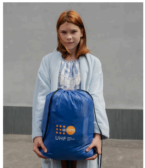
Kherson-Kakhovka Dam, Ukraine.

The ongoing humanitarian crisis in Ukraine also calls for integrated recovery and development support, focusing on vulnerable and remote areas. UNFPA's collaboration with the Government in Ukraine and those in neighbouring countries and international and national civil society organizations is key to delivering life-saving GBV and SRH services, achieving universal health coverage and developing national GBV services networks. UNFPA's need for flexible, long-term funding is also critical to fostering demographic resilience.